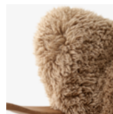
*Sheepskin Honey 50 mm