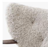
*Sheepskin Moonlight 17mm