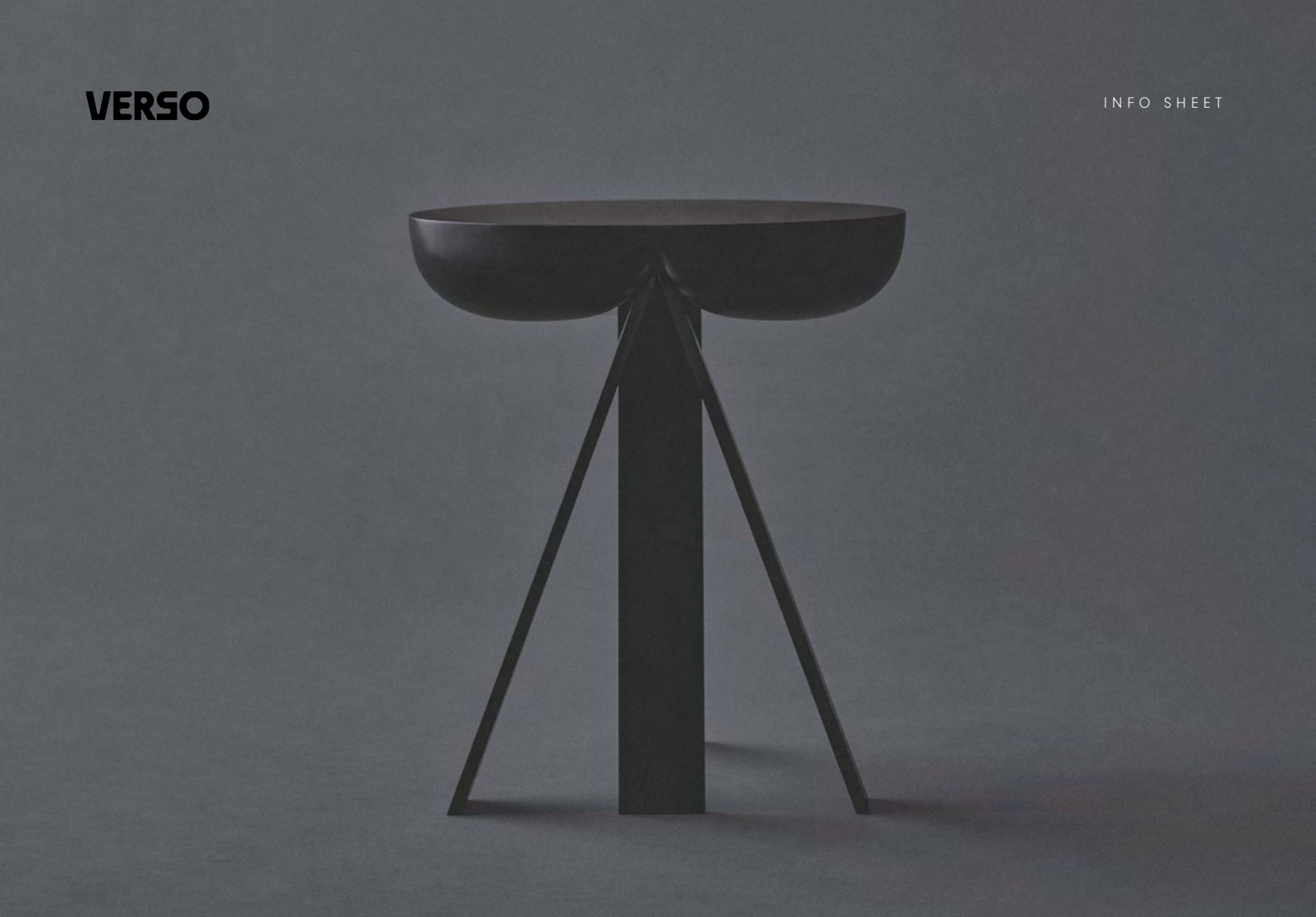
Side Table No. 2 Design PlueerSmitt Year 2014