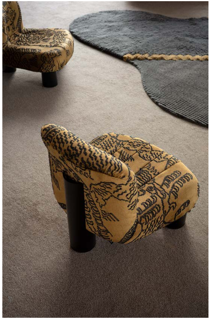
Botolo armchair - capsule collection Tiger 02 Marenco armchair