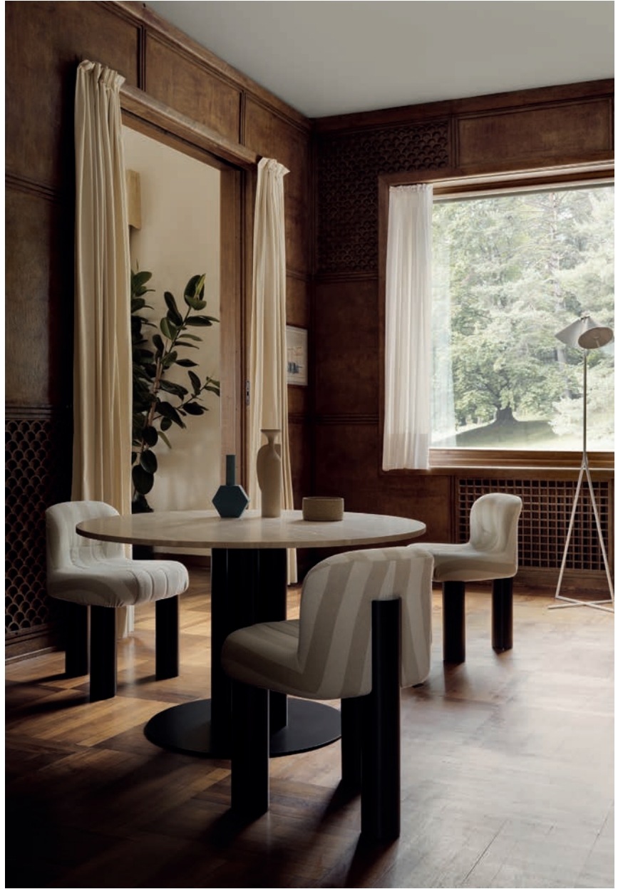
Botolo armchair Goya table